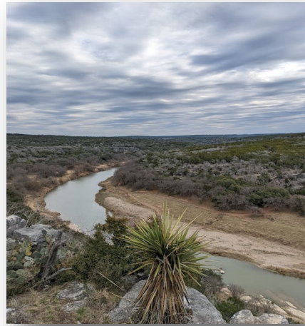
Cedar Chopper Trails Colorado Bend State Park San Saba County October 8, 2022

You must pre-register for all Colorado Bend State Park hikes by September 23 to ensure entrance to the park. The park fills rapidly over holiday weekends and the park is limiting us to 35 vehicles.