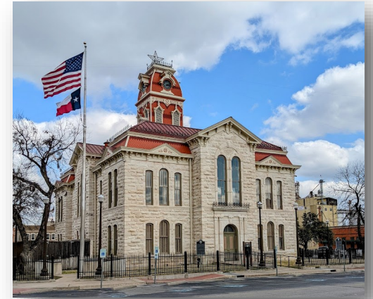
Historical Lampasas, Texas Lampasas County October 6-9, 2022

Directions: From the intersection of U.S. highways 281 and 183 in Lampasas, take FM580 west 24 miles to Bend and follow the signs four miles to the park entrance. Continue on Park Hill Drive Road for about seven miles until it ends at the Park HQ. Turn right on dirt road that runs parallel to the Colorado River. The road ends at the Spicewood Spring Day Use area and the Spicewood Springs Trailhead. Please carpool to the trailhead.