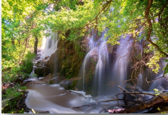
Gorman Falls and Spring Trails Colorado Bend State Park San Saba County October 7, 2022

Trail Start: Gorman Falls and Spring Trailhead