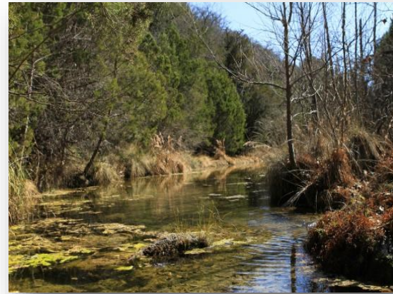
Spicewood Springs Trails Colorado Bend State Park San Saba County October 9, 2022

Directions: From the intersection of U.S. Highways 281 and 183 in Lampasas, take FM 580 west 24 miles to Bend and follow the signs four miles to the park entrance. Continue on Park Hill Drive Road for about 2.9 miles to Cedar Chopper Trailhead and parking lot. Please carpool to the trailhead.